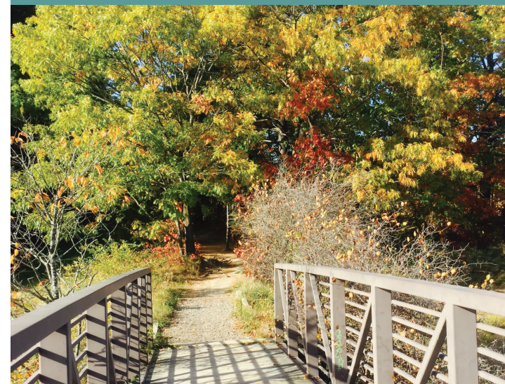
Summer night at Deering Oaks Park Fore River Sanctuary

The hike features wooded areas, marshes, and bridges. The lowland area, where salt and freshwater marsh meet, provides great bird-watching opportunities.