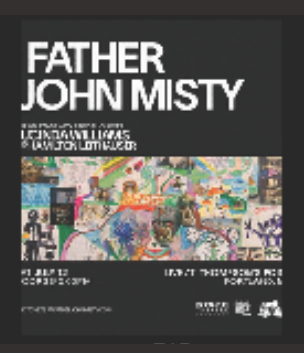
Saturday July 12