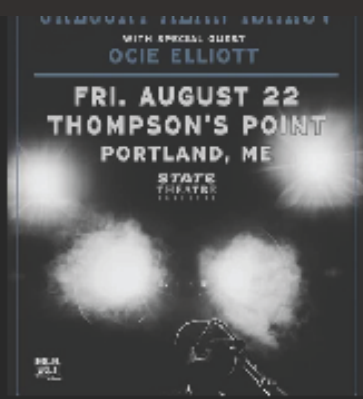
Friday August 22