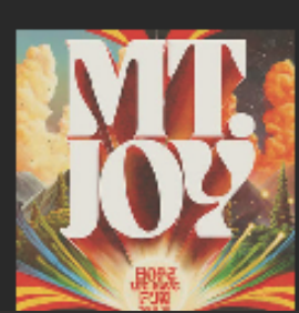
Thursday June 19