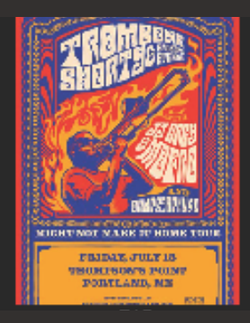
Friday July 18