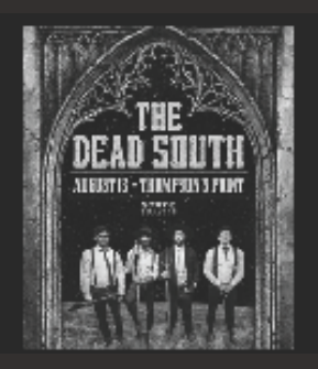
Wednesday August 13