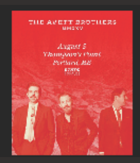
Tuesday August 5