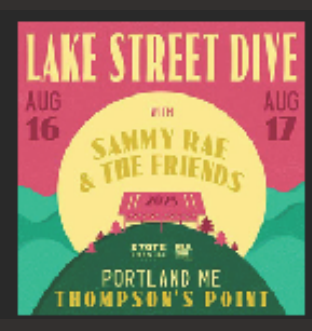
Sat/Sun August 16-17