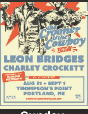
Sunday August 31