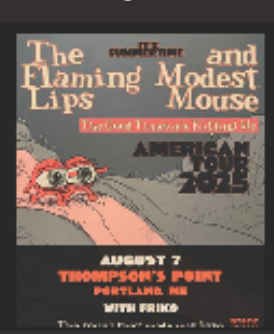
Thursday August 7