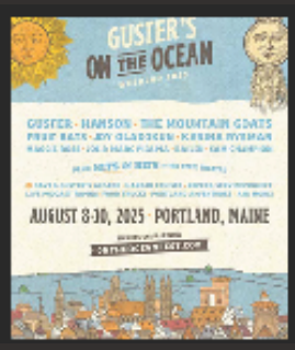
Sat/Sun August 9-10