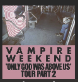
Thursday May 29

* Thompson's Point Concert Schedule May 29 - September 3, 2025*