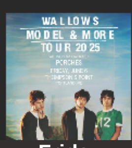
Friday June 6