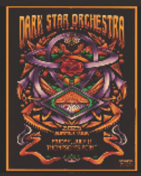
Friday July 11