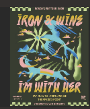
Saturday July 19