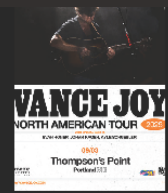
Wednesday September 3

*These concerts will impact Metro's service schedule for Route 1 and BREEZ and may impact service on Routes 5, 7, and 9. Please check for updates.