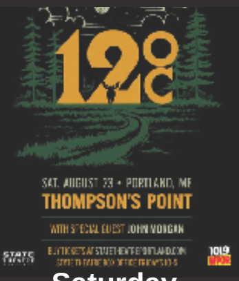
Saturday August 23