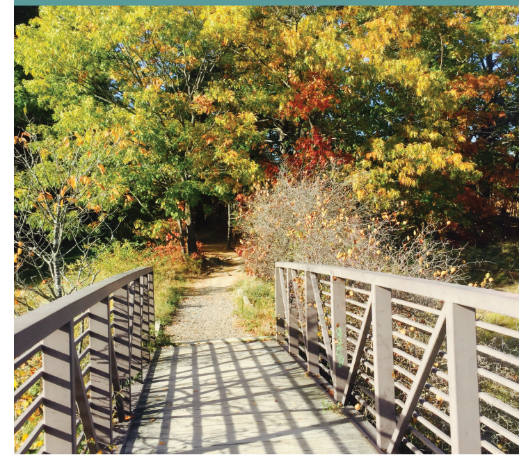
Photos: Summer night at Deering Oaks Park: Corey Templeton Fore River Sanctuary: Denise Beck

The hike features wooded areas, marshes, and bridges. The lowland area, where salt and freshwater marsh meet, provides great bird-watching opportunities.